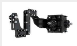
W style self-aligning system