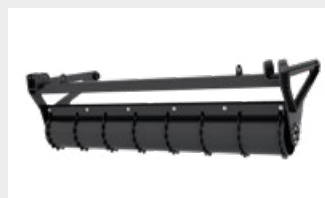
Hydraulic support roller