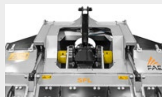
Z style self-aligning system