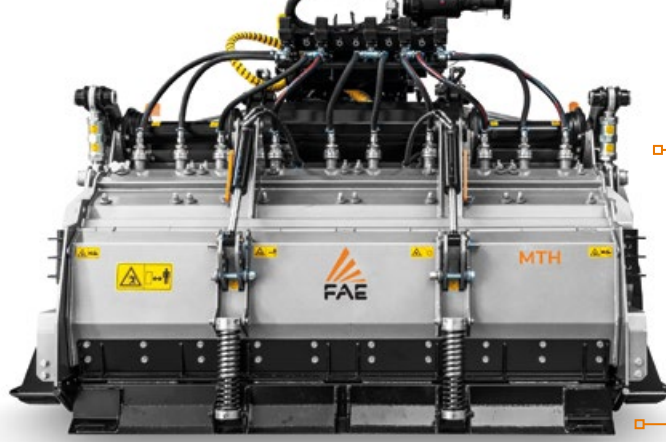
Cooling system guarantees high performance in all working conditions

Internal replaceable protections to allow using the machine in extreme conditions