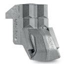
TOOTH STC/3/FP (side scraper)