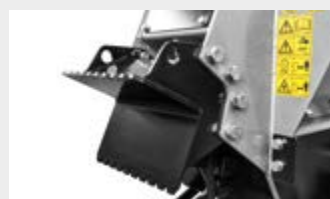
Front fixed thumb