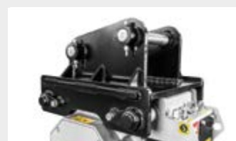
Customized attachment bracket