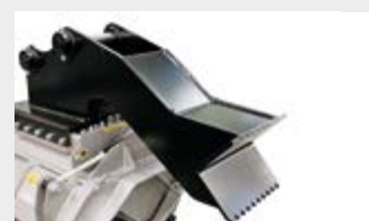
Customized attachment bracket with fixed thumb