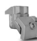
TOOTH STC/3/SS (side scraper)