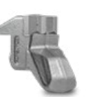
TOOTH STC/3 (side scraper)