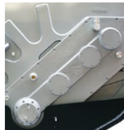
Dual transmission with side gearbox increase power delivery to the rotor