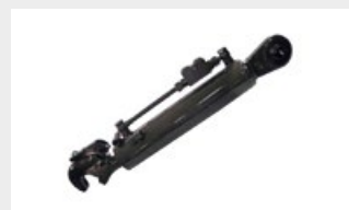
Hydraulic top link