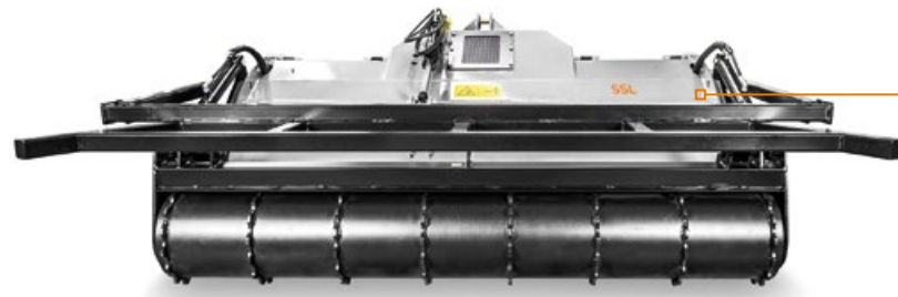
Adjustable counter-blade for longer working life