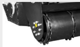
Hydraulic controlled roller helps with compaction and working uneven terrain