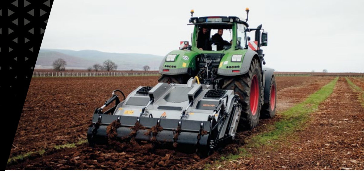
Gearbox with oil cooling system (SSH/HP)