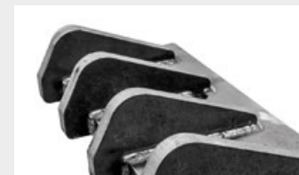
Adjustable counter-blade (forest) for additional processing of wood material