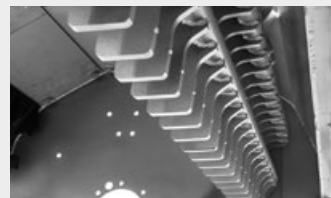
Independent Grid for control of finer product; increased distance between the grid and the rear door allows a better material flow