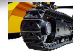
STEEL TRACKS (option)

Hydraulic variable track system with independent undercarriage frames and an automatic tensioning system built to work in the toughest conditions, thanks to a rubber tracks structure, roller system and idlers.