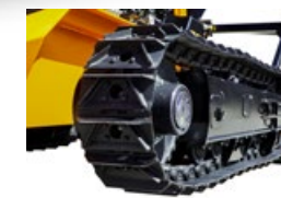
STEEL TRACKS (option)

Hydraulic variable track system with independent undercarriage frames and an automatic tensioning system built to work in the toughest conditions, thanks to a rubber tracks structure, multiple roller system and idlers.