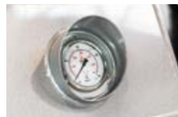
External pressure control Gauge