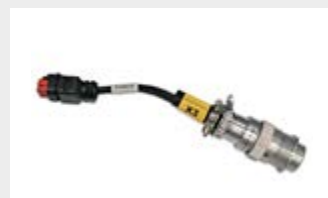
Wiring adaptors Wiring adaptors interface to allow a Plug & Play coupling with the most popular skid steers