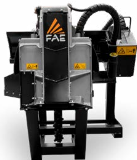
Hydraulic side shifting for accurate positioning over the work area