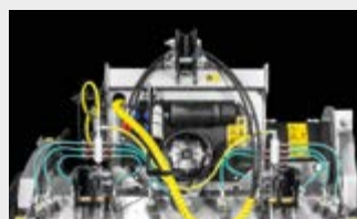
WSS Basic water injection system to reduce dust and cool the teeth