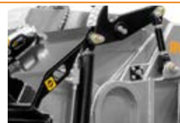
Self-leveling skids with hydraulic depth control