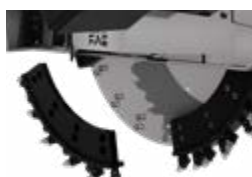
Modular cutting discs of 3.2, 4 or 4.7 inches