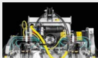
The Water Spray System (Basic & High Flow) cools the teeth to help them last longer