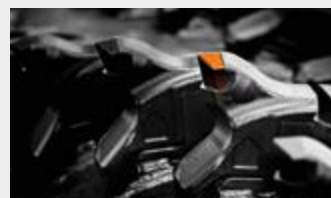
Multiple tooth options