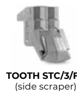
TOOTH STC/3/FP (side scraper)