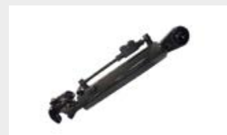
Hydraulic top link