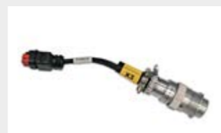
Wiring adaptors Wiring adaptors interface to allows a Plug & Play coupling with the most popular skid steers