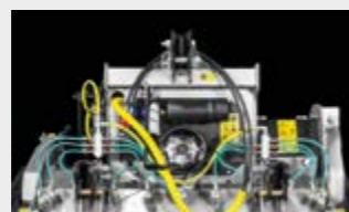
WSS Basic water injection system to reduce dust and cool the teeth