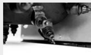
Teeth for working on concrete