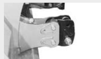
Extended 3 point linkage