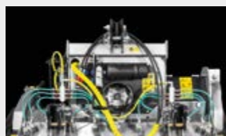
The Water Spray System (High Flow & FCS) has the dual function of cooling and mixing