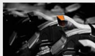
Multiple tooth options