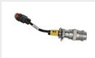
Wiring adaptors Wiring adaptors interface to allows a Plug & Play coupling with the most popular skid steers