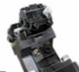
Front hydraulic hood with bolt-on chains

adjustable motor to obtain the maximum performance from any excavator, protected from dirt and damage