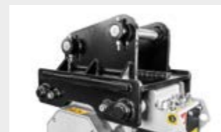
Customized attachment bracket