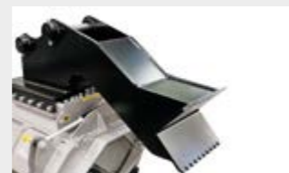
Customized attachment bracket with fixed thumb