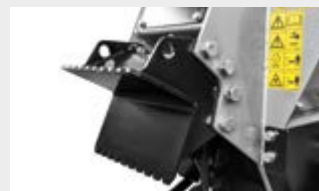
Front fixed thumb