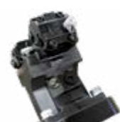
VT (Variable Torque) Motor with automatic torque management