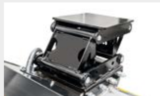
Attachment plate with self-leveling device (optional) adapts to all types of terrain