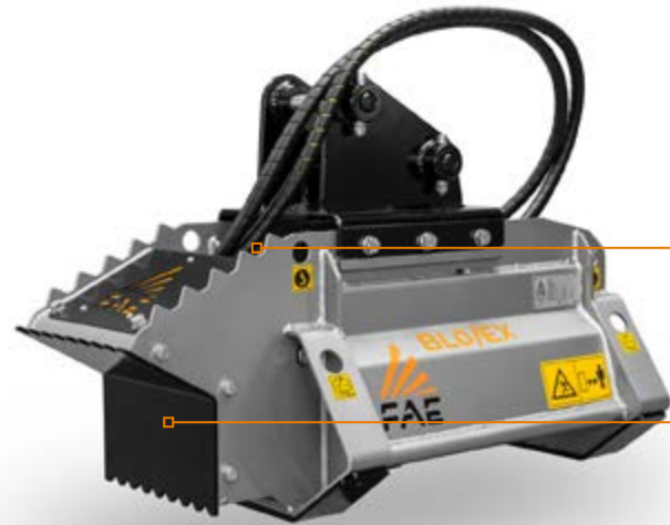
Hydraulic block with flow control valve in the motor