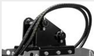
Customized attachment bracket kit with customized pins