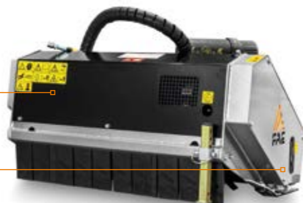
Steel counter-blades helps mulch material into a smaller final size