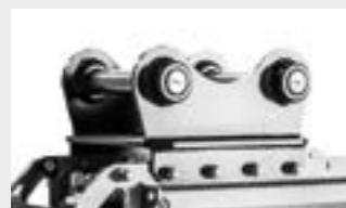
Customized attachment bracket