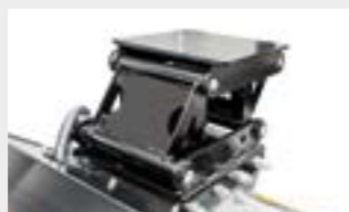
Attachment plate with self leveling device to adapt to all types of terrain