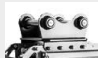
Customized attachment bracket