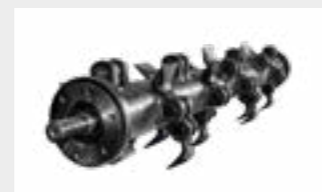
Possibility to have the rotor equipped with PML hammers or Y-flail