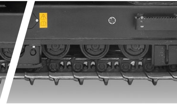
Roller and drive wheel stone guard