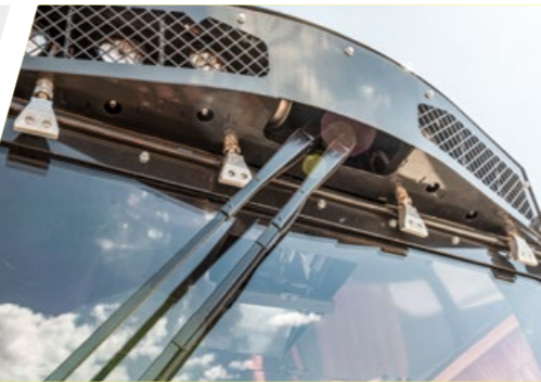
Air window cleaning system