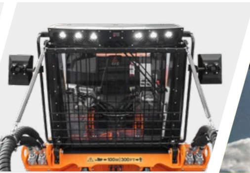
Front cabin grille