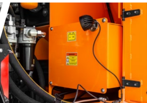
Easy Service package (service light)