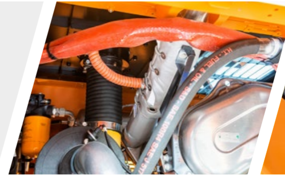
Filtration with heavy-duty ejector