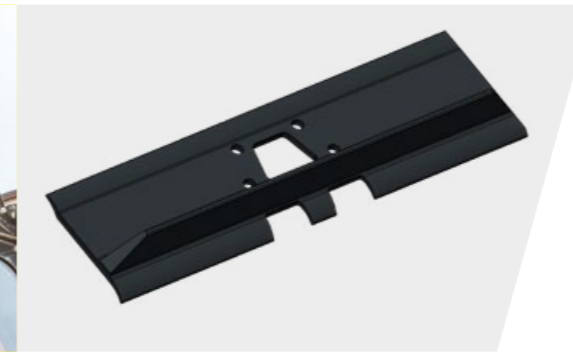
810-mm single-grouser steel pads