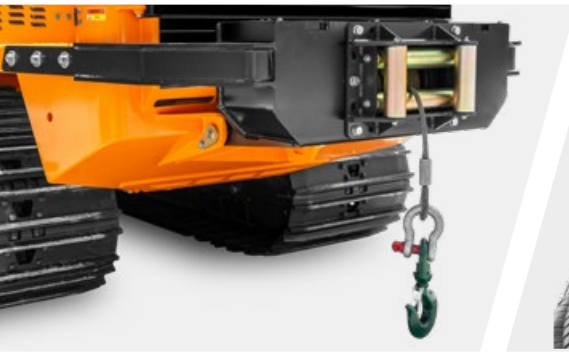
Rear winch with 13-t traction force