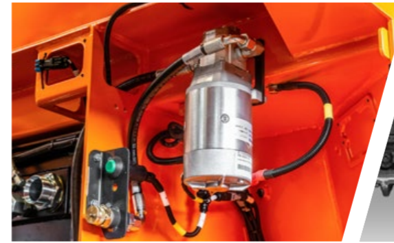
Easy Service package (oil filling pump)