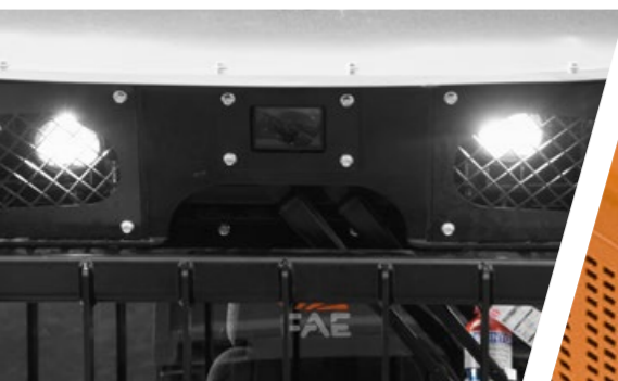
Visibility Package (360° cameras)