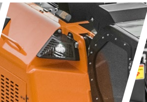
Visibility Package (LED headlights)