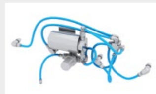
The Water Spray System (High Flow & FCS) has the dual function of cooling and mixing