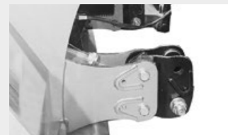
Extended 3 point linkage