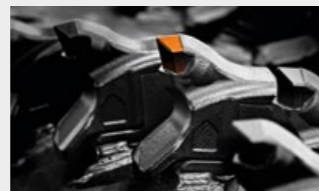
Multiple tooth options