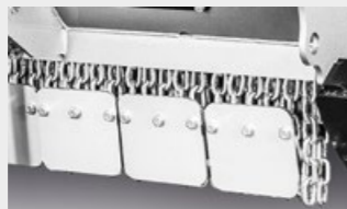
Bolt-on chain's protection plates