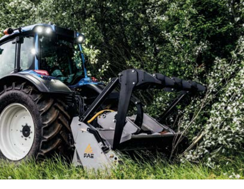
TOOTH K/3 (option)