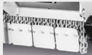
Bolt-on chain's protection plates