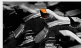
Multiple tooth options