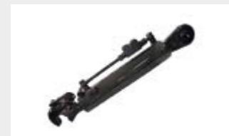
Hydraulic top link