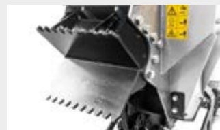
Front fixed thumb