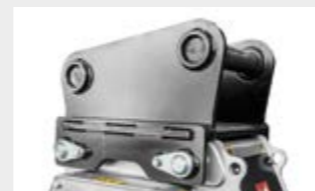
Customized attachment bracket