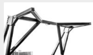
Mechanical push frame guides and pushes material away from carrier