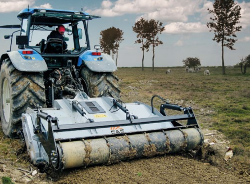
тоотн мн/з (side scraper)