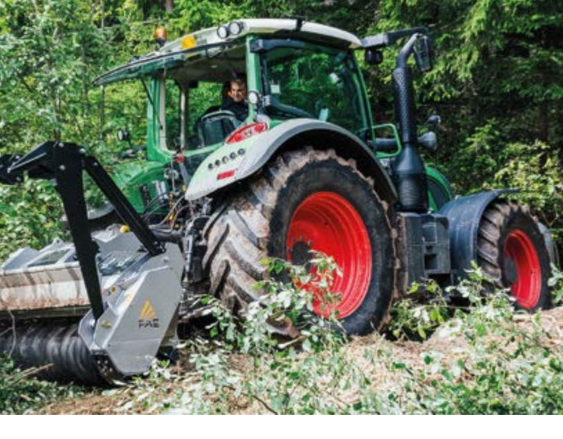
тоотн к/з (option)