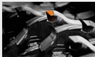
Multiple tooth options