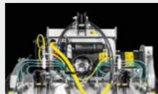
The Water Spray System (Basic & High Flow) has the dual function of cooling and mixing