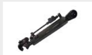
Hydraulic top link