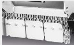
Bolt-on chain's protection plates