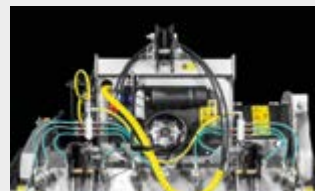
The Water Spray System (High Flow & FCS) has the dual function of cooling and mixing