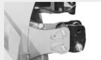
Extended 3 point linkage