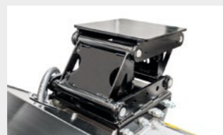
Attachment plate with self levelling device to adapt to all types of terrain