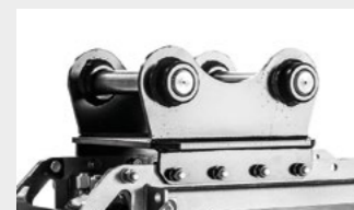
Customized attachment bracket