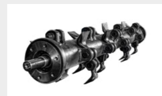
Possibility to have the rotor equipped with PML hammers or Y-flail